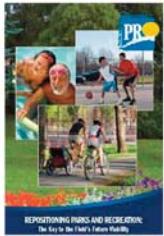
Repositioning Parks and Recreation