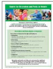
Charter for Recreation and Parks