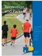
Benefits of Parks and Recreation Services