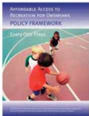
Access Policy Framework